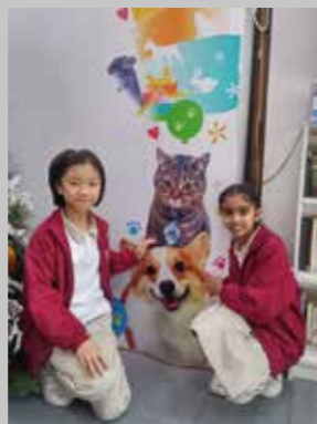
Visit to The Society for the Prevention of Cruelty to Animals