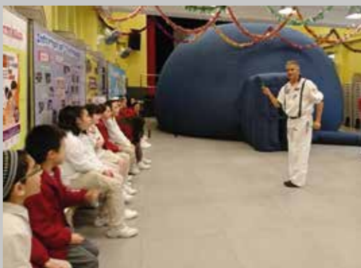
Discovery Dome Astronomy Learning Activity