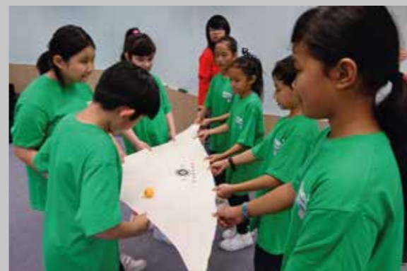
P.4 students engaging in teamwork activities at an Overnight Camp at Hong Kong PHAB Association Pokfulam PHAB Camp on 5th January, 2017

The Understanding Adolescent Project (UAP) enables students to have an in-depth understanding of resilience through engaging in challenging activities.