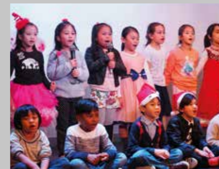
P.1 Christmas song performance