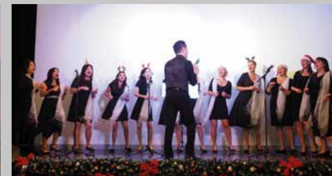
Christmas Song performance by Hong Kong Women's Choir