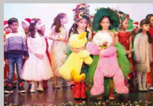
Christmas Costume Competition