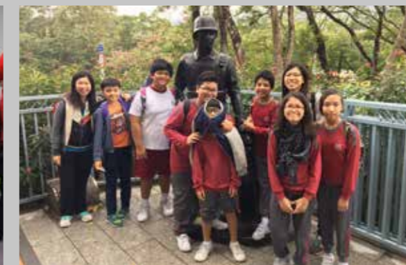
P.6 students visiting Sai Kung Outdoor Recreation Centre on 26th November, 2016.