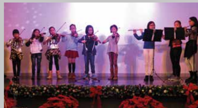
Violin and Flute performance