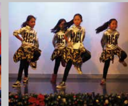
Jazz Dance Performance