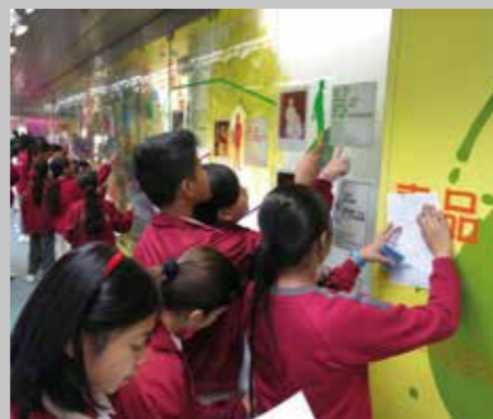
Visit to The Hong Kong Jockey Club Drug InfoCentre