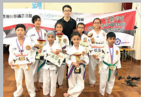
Poomsae Championships 2017 for Primary Schools (9/7/2017)