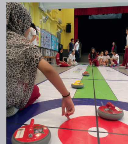
Curling Fun Day