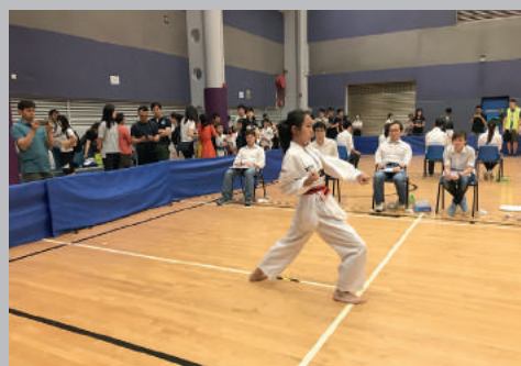
Taekwondo Poomsae Competition 2017 for Primary Schools (3/5/2017)