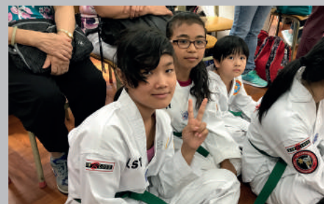
Poomsae Championships 2017 for Primary Schools (9/7/2017)