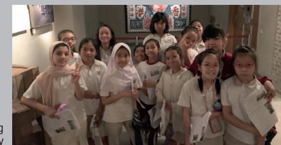
Leap Education Workshop