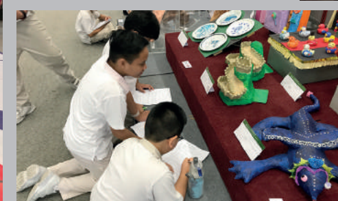
Visit to a Visual Arts Exhibition