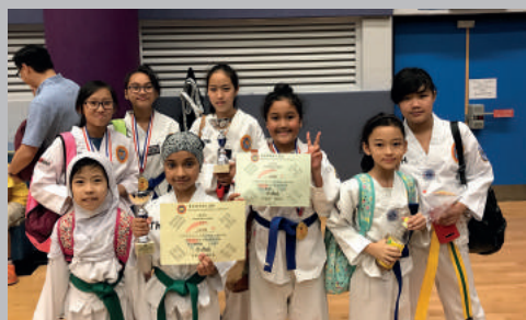
Taekwondo Poomsae Competition 2017 for Primary Schools (3/5/2017)