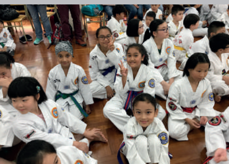
Poomsae Championships 2017 for Primary Schools (9/7/2017)