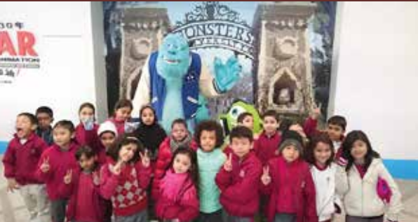
P.2 students visit the Cultural Museum